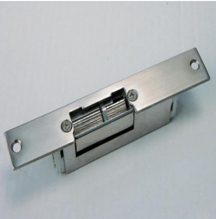
e-lock-S210M / e-lock-S210MF