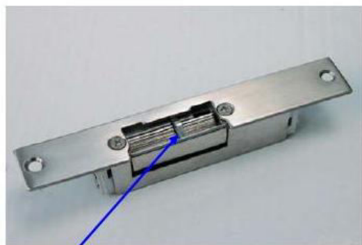
Door Status Signal ( Micro Switch )